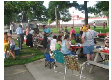
"Hot Ballroom" at the Nelson Neighborhood building.

enforcement to encourage residents to take a stand against crime by showing their solidarity with their neighbors. The many children present enjoyed a variety of kids games while the adults seemed content sharing food and conversation. After the picnic a number of neighbors enjoyed a screening of the inspirational movie "Mad