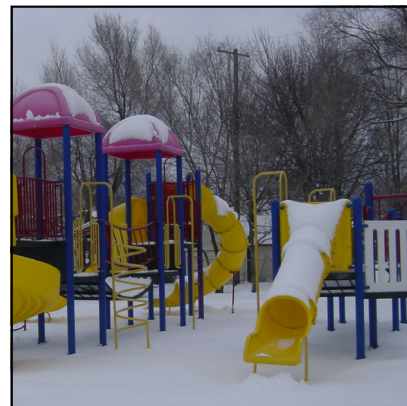
No one at the park now, but hopes are high for next summer.

expected to be made over the winter months with construction slated for spring 2005.